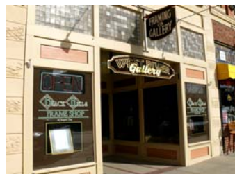
Black Hills Frame Shop

tion given on Friday, May 8 th but maybe more impor-